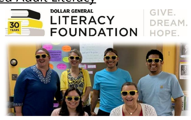
JCLC learners and tutors participating in the Dollar General Yellow Glasses – Literacy Awareness Campaign

A total of 84 adults were served in community programs. These learners received over 1800 hours of instruction. For the first time since the pandemic, classes are full and there is a waiting list for services. Ten open enrollment English classes are offered each week at locations across Jefferson County. Another 18 tutor/learner pairs meet in public libraires and community spaces. One community learner earned a GED and three (3) others continue to work on this goal. Seven (7) individuals are preparing for citizenship.